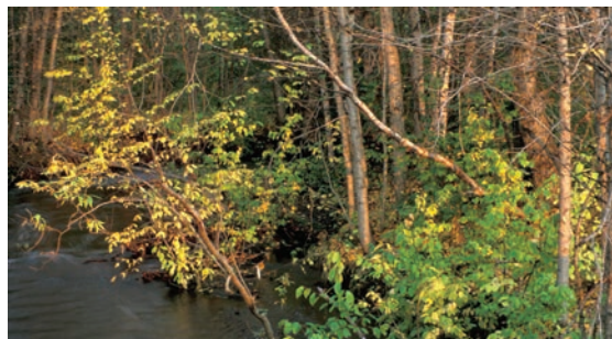
Mayday tree in the understory along Chester Creek, Anchorage

Not all garden species to keep an eye on are herbaceous. There are trees and shrubs which have started spreading beyond the home/commercial landscape. Mayday tree , also known as European birdcherry, Prunus padus , has become established along riparian areas in Anchorage parks and along the Chena River in Fairbanks. At this point, the Amur chokecherry, Prunus mackii , has not been noticed escaping into wild areas. Siberian peashrub , Caragana arborescens , seedlings have also been noted spreading out from original plantings in Mat-Su. Tatarian honeysuckle , Lonicera tatarica , has completely degraded woodland composition in parts of the Midwest and should be watched to make sure that it does not become established in the wild in Alaska. European mountain ash , Sorbus aucuparia , has escaped cultivation in Anchorage and Southeast Alaska where native species of mountain ash exist.