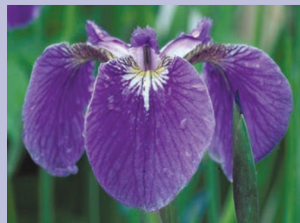
Alaska wild iris

Human actions are the primary means of invasive species introductions. Gardeners can be part of the solution. Don’t plant invasive species intentionally.