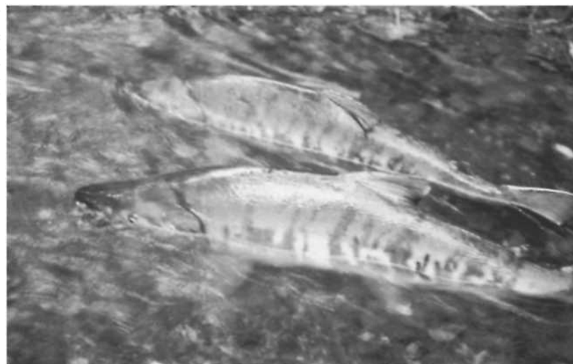
Spawning salmon provide a period of high food abundance to other animals such as eagles or mink.