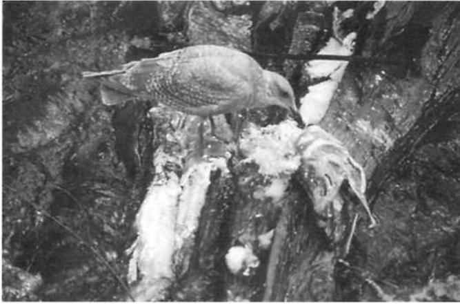
Salmon carcasses often affect many production levels in stream ecosystems.

species of salmon may contribute varying amounts of nutrients based on their intrinsic spawning densities and biomasses. Sockeye salmon typically spawn in high numbers, as do pink and chum salmon. More-dispersed spawning species such as coho salmon may transport fewer overall nutrients during a spawning run, although their nutrient subsidy is significant, particularly in the smaller streams they tend to use. Anadromous trout such as cutthroat and steelhead can repeatedly provide nutrients and energy to aquatic and terrestrial systems, at least through egg deposition, since up to 30% may live through their first spawning (Stolz and Schnell 1991). Evidence also exists that certain terrestrial insects, as shown by their maggots, will colonize carcasses rapidly and consume a significant amount of salmon biomass (Reimchen 1994).