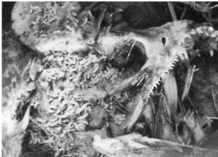
Fly maggots facilitate decomposition of salmon carcasses.