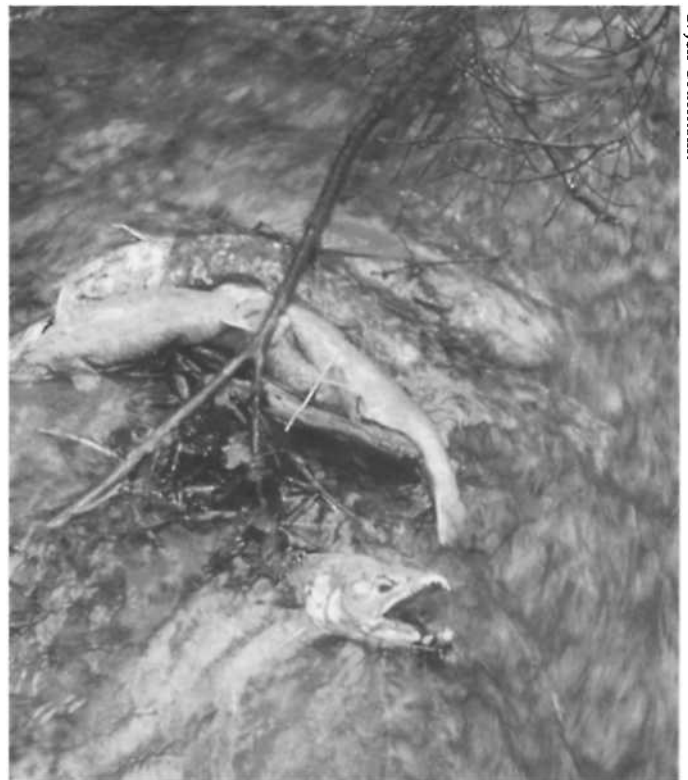
Small organic debris helps retain chum salmon carcasses in Kennedy Creek.

Many studies have suggested that other variables influence the use of nutrients released by salmon carcasses. Donaldson (1967) found that the quantity of nutrients introduced into freshwater systems was related to how many adults return to spawn. Consequently, different