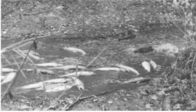
Live and dead chum salmon spawners lie in a small tributary of Kennedy Creek near Olympia, Washington.

lakes. The researchers suggested that the primary pathway of marine-derived nitrogen into biota was not through direct consumption of eggs and fry, but rem mineralization , or uptake by primary producers. This supports the ideas of Juday et al. (1932), Donaldson (1967), and Mathisen et al. (1988) that primary production is an important means of uptake of nutrients released by carcasses in lake systems.